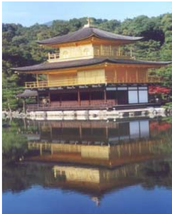
Golden Pavilion, Kyoto

Sanjusangendo Hall is so nicknamed for the 33 spaces between its pillars. This long, narrow hall was last rebuilt in